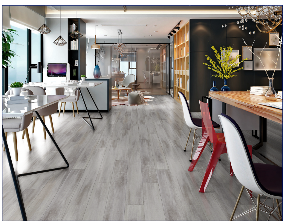
Metroflor LVT - Over The Top: Chalk